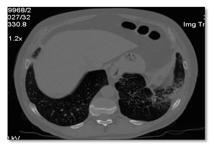
Figure 3. Chest CT of the pulmonary window, condensation area associated with frosted glass pattern ( 20 \times 30 mm) in the basal anterior and lateral segments of the left lobe.

The condition is interpreted as an acute exacerbation of its underlying pathology and is treated with antibiotics, salmeterol puff and fluticasone. After 20 days a respiratory function test is done. The reduced diffusion capacity indicates a moderate degree of loss of functional alveolar capillary surface. It is interpreted as very severe obstructive airway pathology.