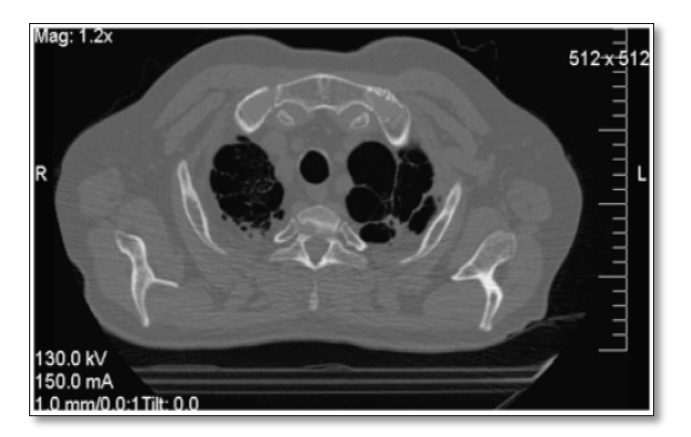
Figure 1. Chest CT of the pulmonary window, centripanlobulillar and paraseptal emphysema, associated with cystic areas, biapex predominantly left.

There are also important signs of centripanlobulillar and paraseptal enfiesema, with other areas, also with absence of parenchyma corresponding to pulmonary cysts, being those of higher hierarchy located in the biapical region and predominantly of the left lung (Figures 1 and 2).